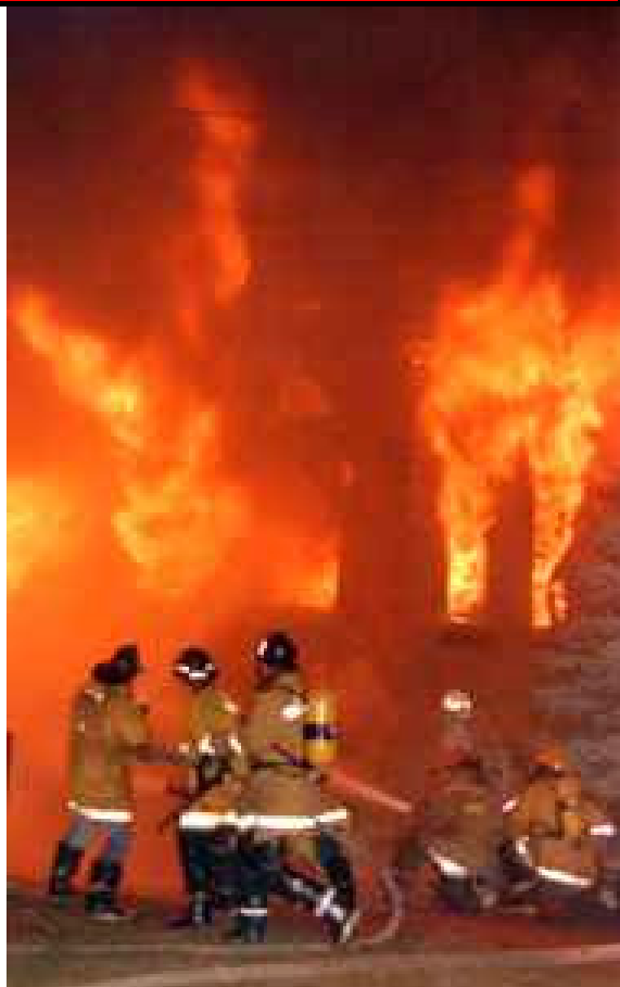
NRCFD wardens fight fires at a Industrial Zone warehouse where 15 Caligula employees died.

Editor's Note: The FFP still have a compulsory termination order (EX - 63/ 002) with a 1K price on each body brought back to Talon Central for processing. If you get the leader, you get 10K!